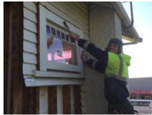
Connaugh Street & Cook

I have learnt a lot about the aspects of carpentry in commercial building at my placement. I have worked on the new Countdown in Vogeltown and also the new BP in Moturoa.