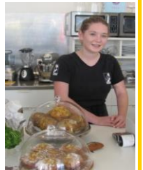
Cascade Espresso Cafe

I am enjoying being part of the vibrant team here, learning new skills, cooking and serving customers. I look forward to a future in hospitality now and am excited about working part time at Espresso as well.