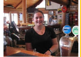
Chelsea Treehouse Bar

The Treehouse Bar has given me a huge insight into the hospitality industry. It is a very social and skilful job. In the future I would like to own my own bar, I already have my Licence Controller Qualification.