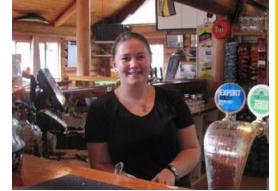
Chelsea Treehouse Bar

The Treehouse Bar has given me a huge insight into the hospitality industry. It is a very social and skilful job. In the future I would like to own my own bar, I already have my Licence Controller Qualification.